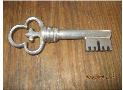
Nothing more to say! Beautiful!