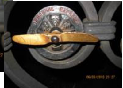
This is the NOMMA entrance gate and a few of the details from it.