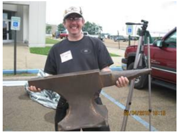
Man you guys are strong.