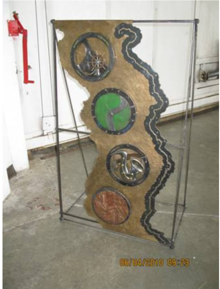
To your right is the River Ring Project, just in case you couldn't tell.