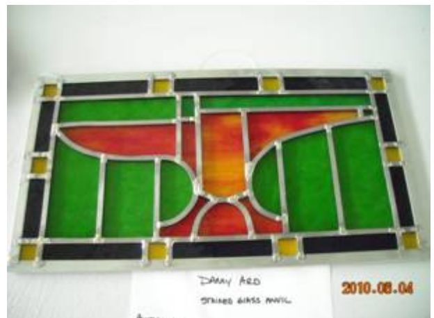
DANNY AED STAINED GLASS PANEL Aston